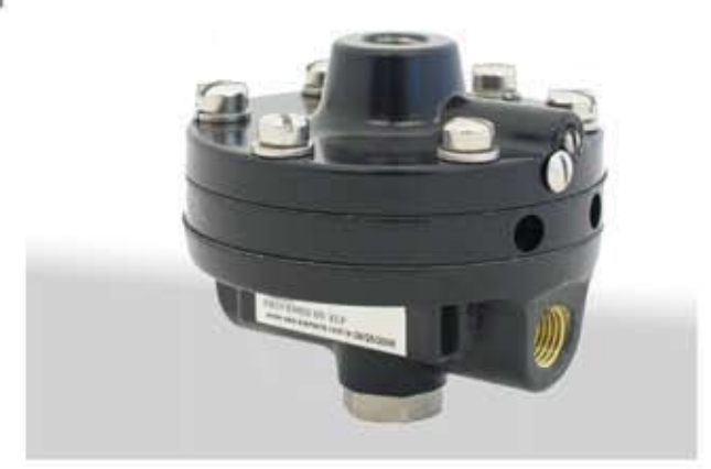
Model 61H is shown

The Model 61F High Accuracy Booster Relay via the sensitive preformed diaphragms in this relay provides greater accuracy in 1:1 transmission. Its output capacity is about 1/4 that of the Model 61L. As such, it is suitable for use in measuring circuits.